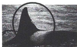
dorsal fin and saddle patch

Try to take picture of Photographs will not be used for commercial purposes and copyright will remain with the photographer