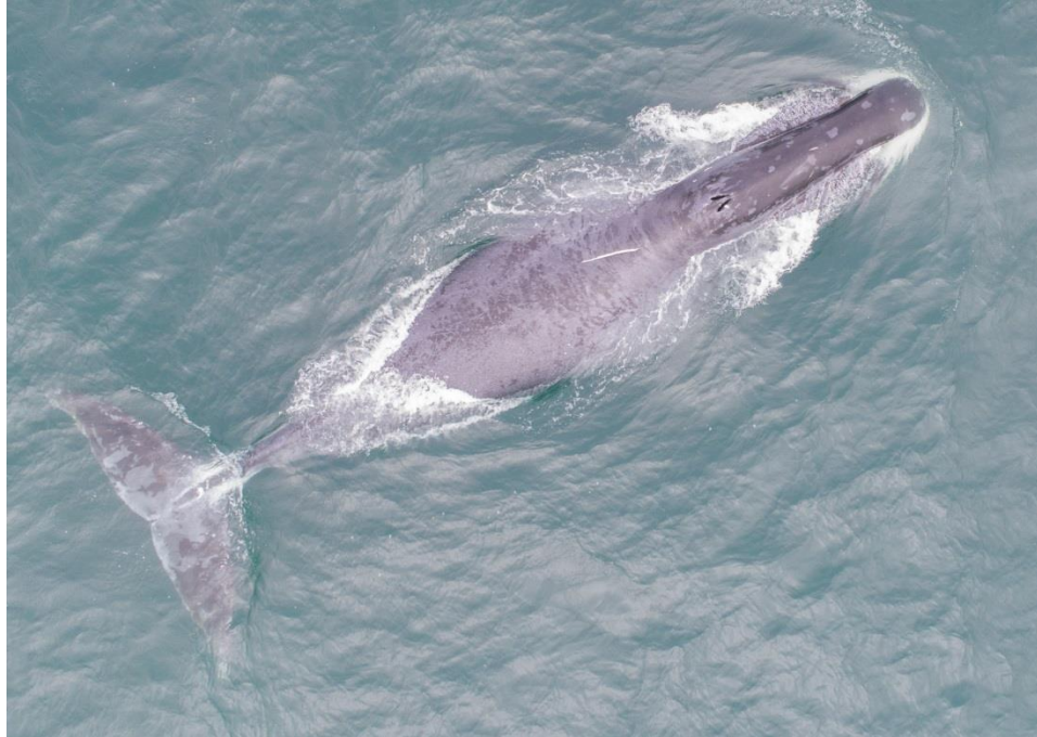
Figure 3. Bowhead whale 50609 encountered in Kingnait Fiord on 8 August 2018

In 2018, an updated abundance estimate for EC-WG bowheads was obtained using genetic capture-mark-recapture analysis. The estimated abundance was 11,916 individuals (95% HDI = 9,073-16,185) and incorporated genetic samples collected up until 2016. From field work conducted in 2017 and 2018 there are 145 biopsy samples available to add to future analyses, with additional biopsy samples recently collected in Cumberland Sound in 2019.