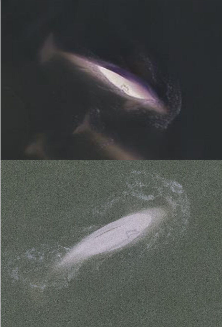
Figure 4. Beluga whale #17, photographed on August 18, 2017 (above) and August 11, 2018 (below) in Clearwater Fjord, Cumberland Sound.