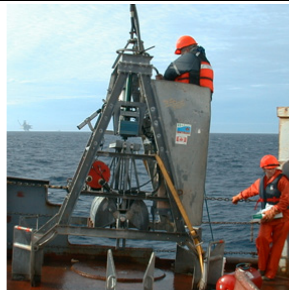
Figure 2. The ship and equipment that we will use in our survey.

Below: Videograb- video camera linked to a bottom sample grab so we can see what we are sampling.