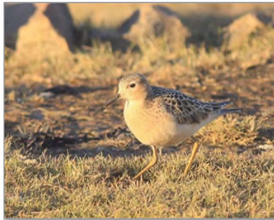
Buff-breasted Sandpiper at Seal River Estuary Important Bird Area

Issue: Request for decision to approve the Management Plan for the Buff-breasted Sandpiper ( Tryngites subruficollis ) in Canada under the federal Species at Risk Act (SARA).