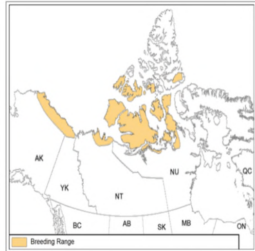
North American breeding distribution of the Buff-breasted Sandpiper. The species is distributed sparsely across the depicted breeding range, taken from the COSEWIC Status Report (2013).