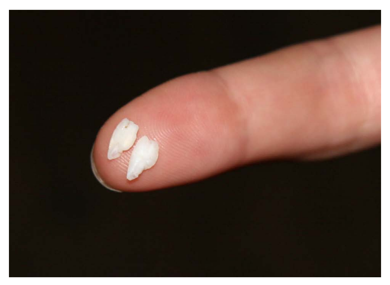
Fig. 1. Paired sagittal otoliths from an adult lake trout.