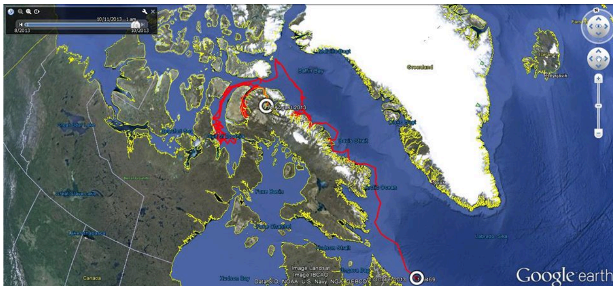
Figure 1: Summary track for one killer whale equipped with a satellite transmitter from 12 August to 11 October, 2013. The track begins in Milne Inlet, northern Baffin Island and terminates just north of Labrador.

11 September, and the final tag continued to transmit locations until 11 October. The summary track for the final tag is shown in Figure 1.