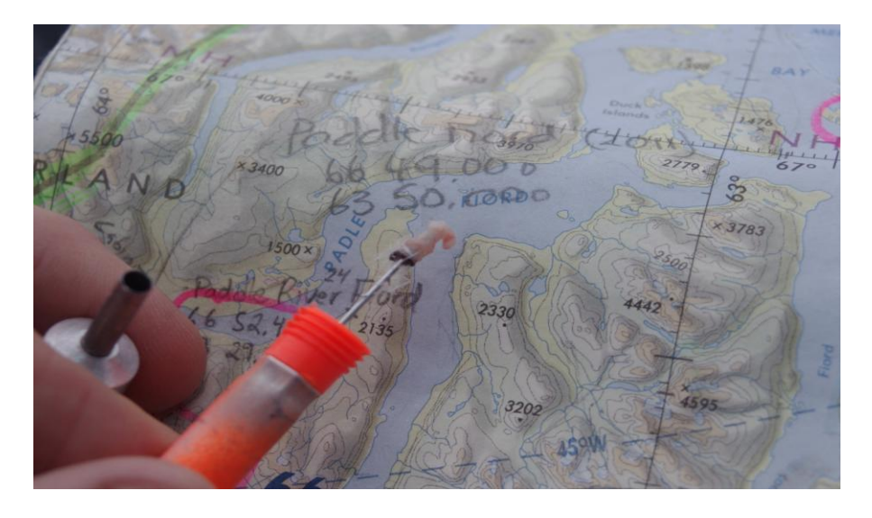
Figure 1. A sample of skin and fat obtained by a DNA dart.