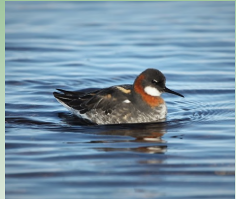
Female Red-necked Phalarope

This section of the proposed management plan for Red-necked Phalarope provides descriptive information such as what they look like, where they live and what they need to survive.