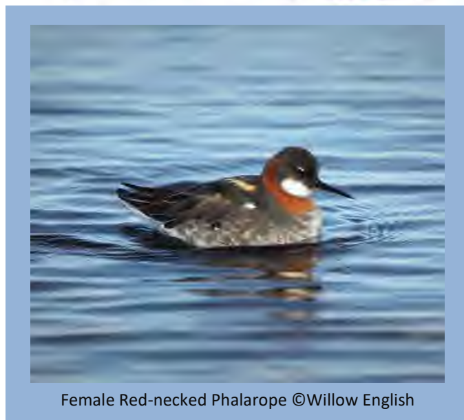
Female Red-necked Phalarope

The Red-necked Phalarope breeds near Arctic tundra wetlands with open water and few shrubs. Unusually, females compete for mates and males provide all parental care. The species spends the entire non-breeding season on the water, either at sea, or in wetlands