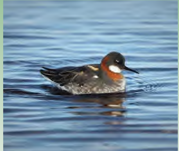
female Red-necked Phalarope

The Red-necked Phalarope breeds near Arctic tundra wetlands with open water and few shrubs. Unusually, females compete for mates and males provide all parental care. The species spends the entire non-breeding season on the water, either at sea, in wetlands and waterbodies, especially salt lakes, along the inland migratory route.