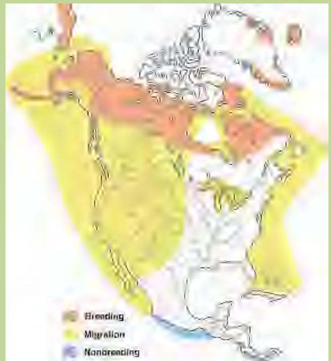
Distribution of the Red-necked Phalarope (from Cornell Lab – Birds of North America's Website, Rubega et al. 2000)