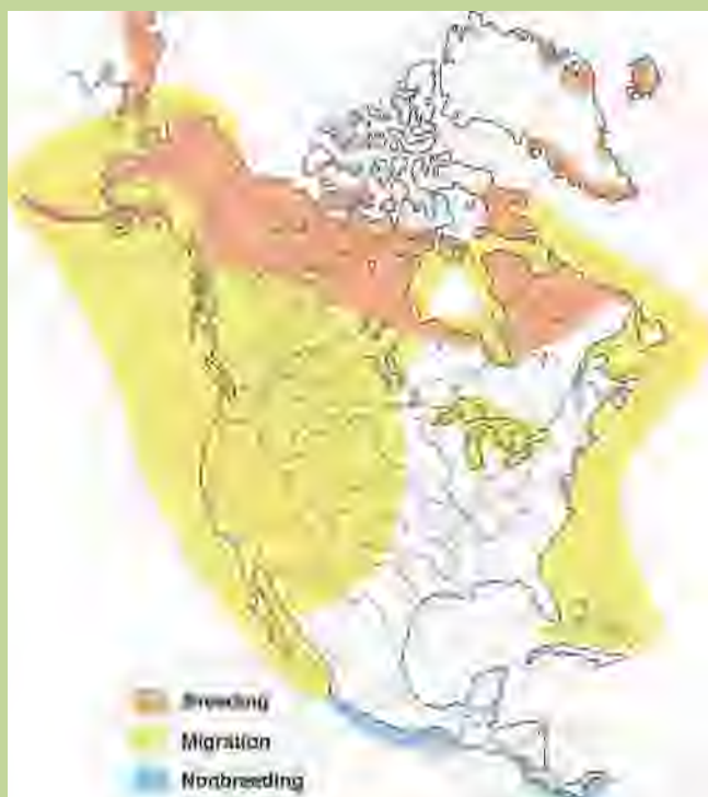
Distribution of the Red-necked Phalarope (from Cornell Lab – Birds of North America's Website, Rubega et al. 2000)