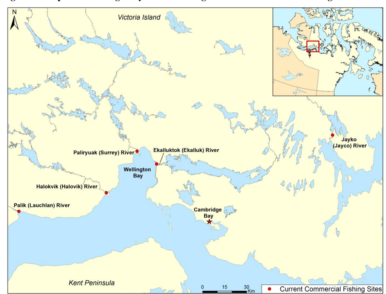
Figure 2: Map of Cambridge Bay Area Showing Current Commercial Fishing Locations.