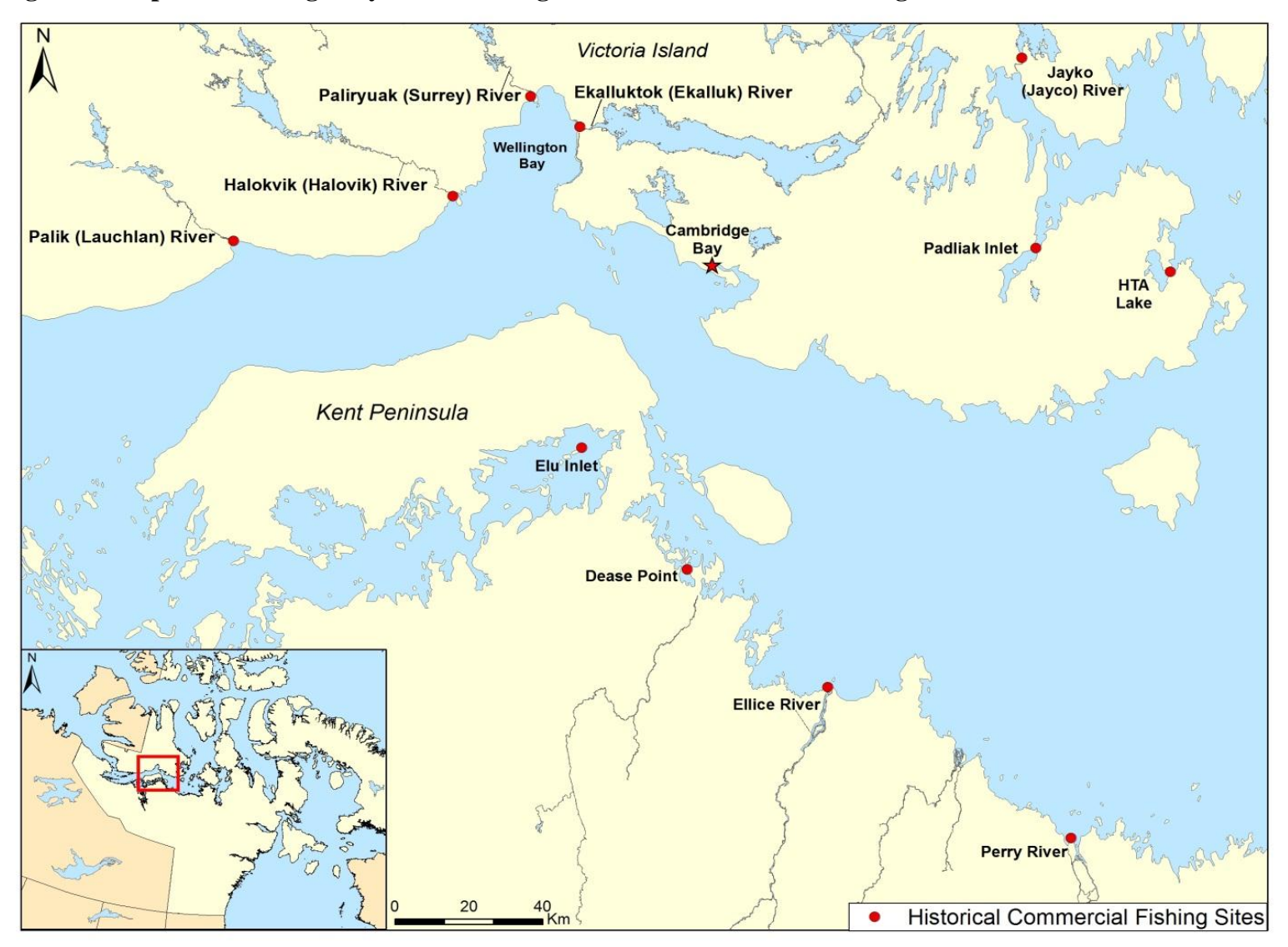
Figure 3: Map of Cambridge Bay Area Showing Historical Commercial Fishing Locations.