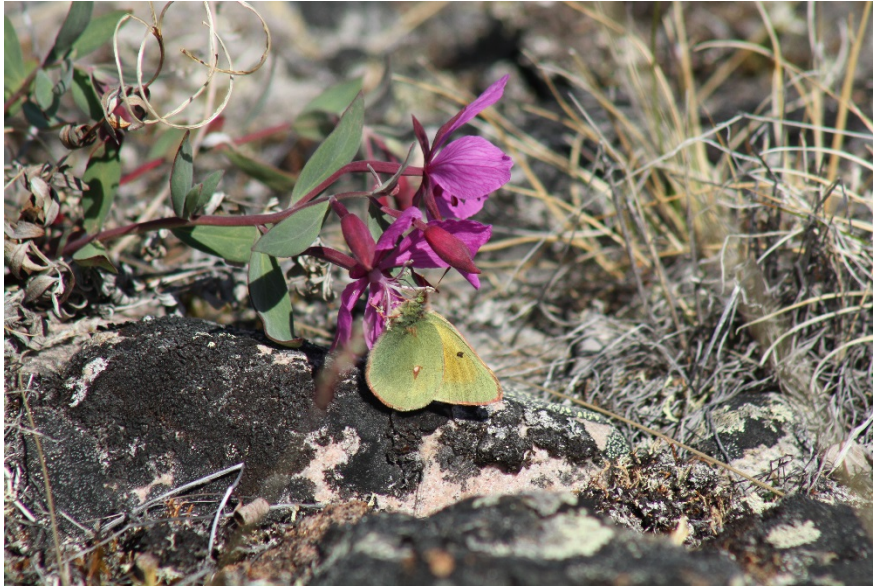
Figure 14: ClouDED yellow sulfur ( Colias palaeno ) on dwarf fireweed.

Animals observed and Inuit Qaujimagatuqangit