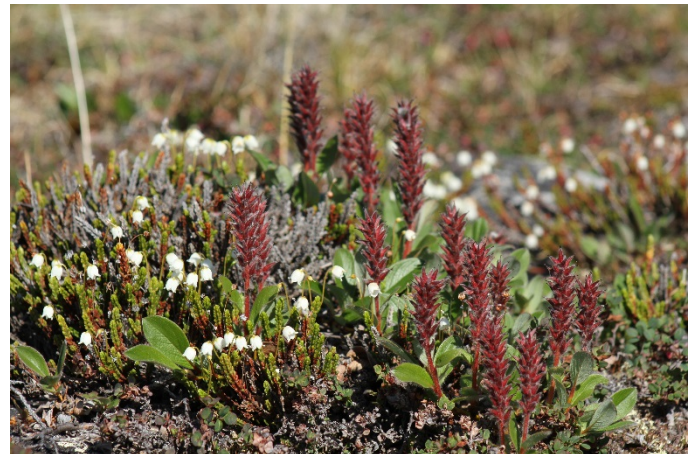
Figure 13: These willow catkins are still edible, but they are about to grow fur.

It is thought that when the willow catkins start to grow fur, it means the bull caribou are starting to get back fat and are good for harvesting.