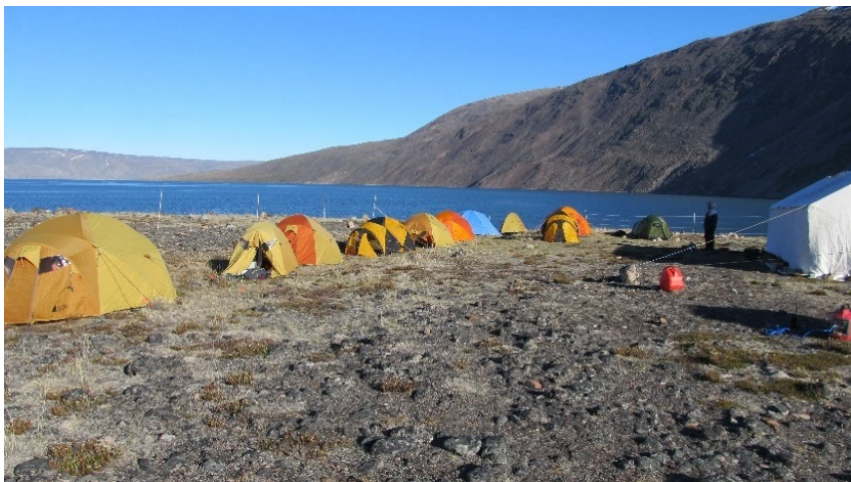
Figure 4: BioBlitz Base Camp, at Nanuqsiutitalik/Paquet Bay.

Participants established a Base Camp at Nanuqsiutitalik, where they camped for the duration of the BioBlitz.