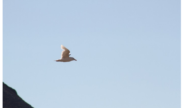
Figure 16: Glaucous gull ( Larus hyperboreus ).