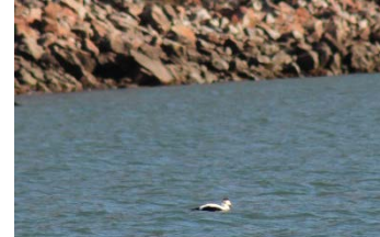
Figure 15: An eider duck spotted near the BioBlitz Base Camp.

Eider ducks start to arrive in north Baffin in mid-April. As soon as they lay eggs, the males disappear and the females stay to look after the young. In the fall, when the ice forms, you mostly see female eider ducks.