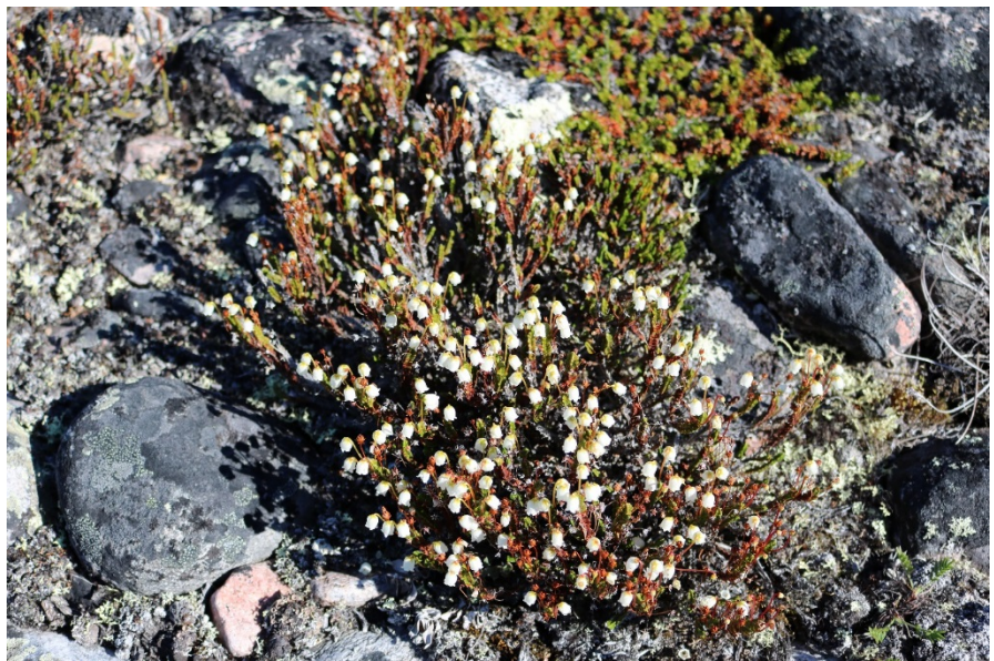
Figure 16: White heather ( Cassiope tetragona ).

The heather in Nanuqsiutitalik is larger than the heather near the town of Pond Inlet, likely due to the warmer and sheltered climate.