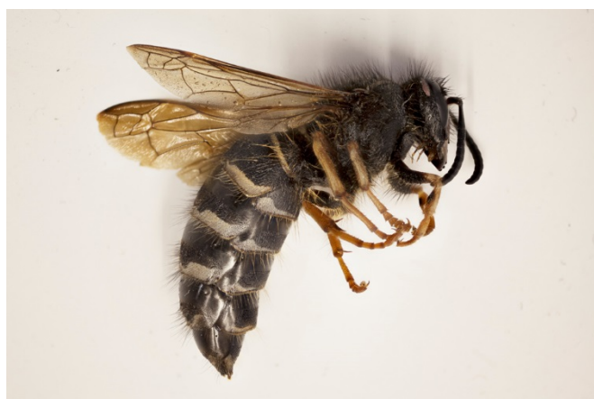
Figure 12: Dolichovespula albida , a large species of wasp, captured by one of the participants.