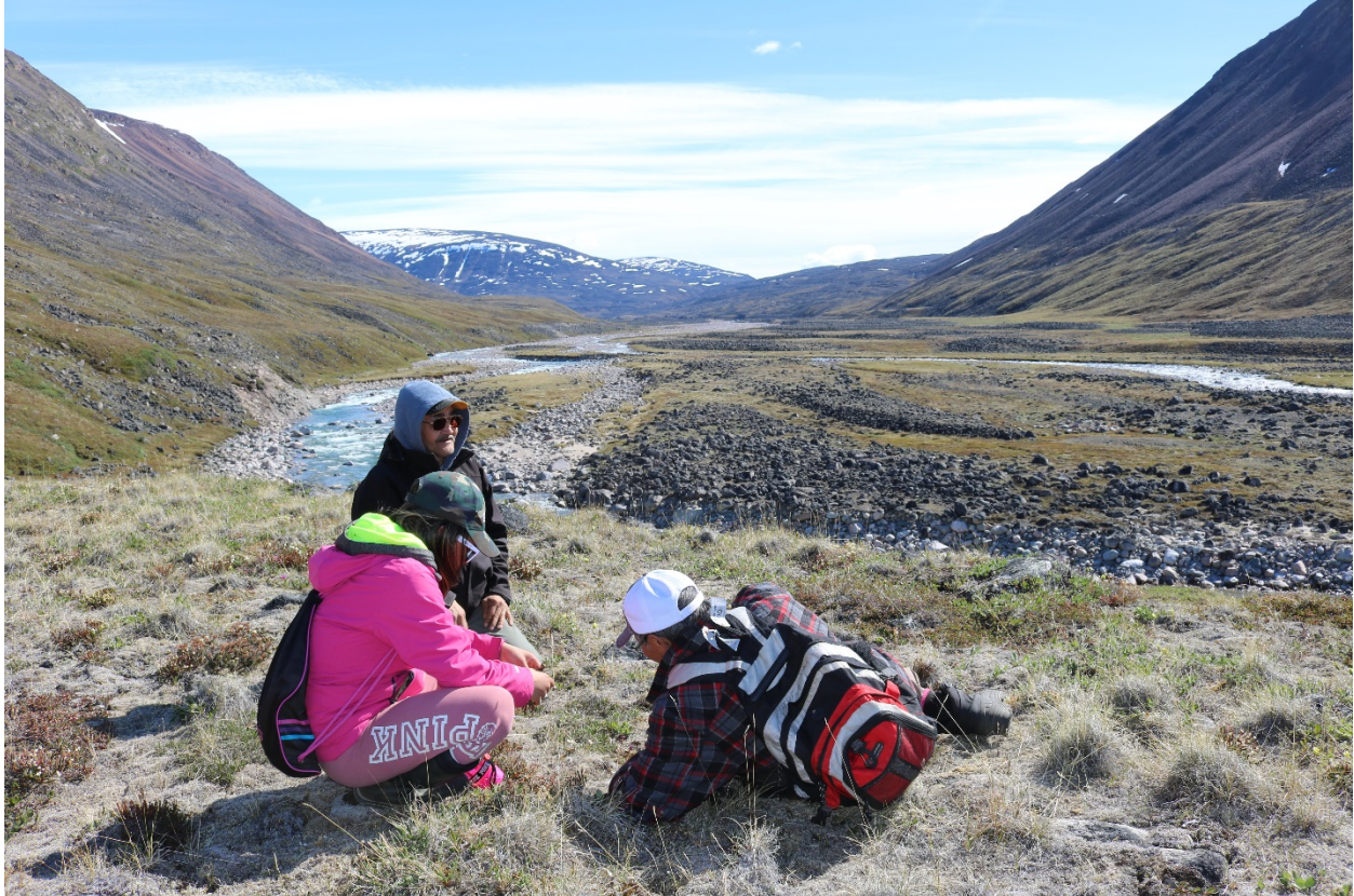
Figure 1: Participants observe and discuss plant species during the Sirmilik National Park BioBlitz.