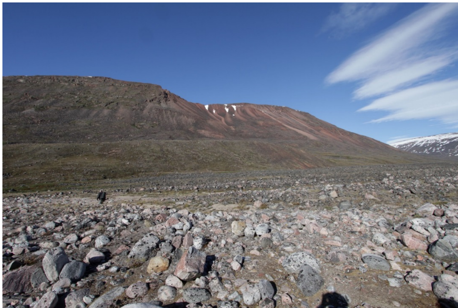
Figure 28: Photo of habitat in bird survey plot SIR29D.

Two survey sites were visited during the Sirmilik National Park BioBlitz (Figure 3). The plots were in dry, hilly areas that were mostly covered in small shrubs, as well as boulder fields (Figure 26).