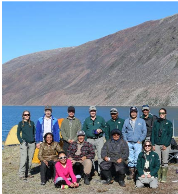
Figure 2: Participants in the Sirmilik National Park BioBlitz.