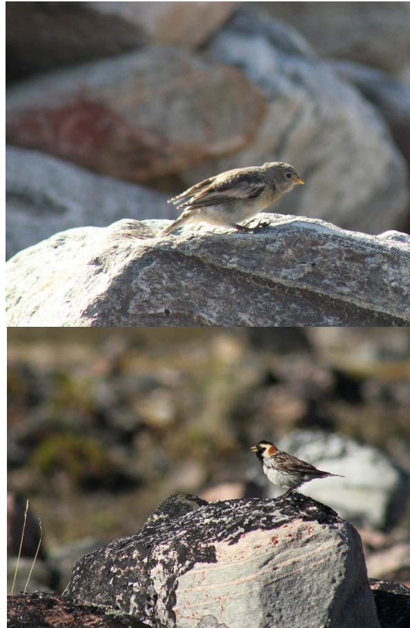
Figure 29: Juvenile snow bunting (above) and adult Lapland longspur (below), observed during the bird surveys.

A total of 59 bird observations were made (Table 1), including males, females, birds of unknown sex, juveniles, and probable nests. A probable nest means that one bird or a pair of birds was observed, and their behaviour indicated that they were tending to a nest nearby. Three species were observed: snow buntings ( Plectrophenax nivalis , qauluqtaat , ᖃᑲᑲᑦᑕᑦ), Lapland longspurs ( Calcarius lapponicus , qinniqaat , ᖃᑲᑲᑦᑕᑦ), and American pipits ( Anthus rubescens , inguiqsajut , ᐃᑦᑲᑲᑦᑕᑦ), which refers to the way the bird's tail goes up and down, like the action of copulating).