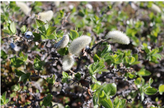
Figure 8: These willow catkins are delicious!

In the next valley over (Tuniit, outside the park), where it is warmer and more sheltered, the willows and birches grow up to 8-10 feet tall. They grow straight up there, instead of crawling on the ground, so they were collected and used for harpoons.