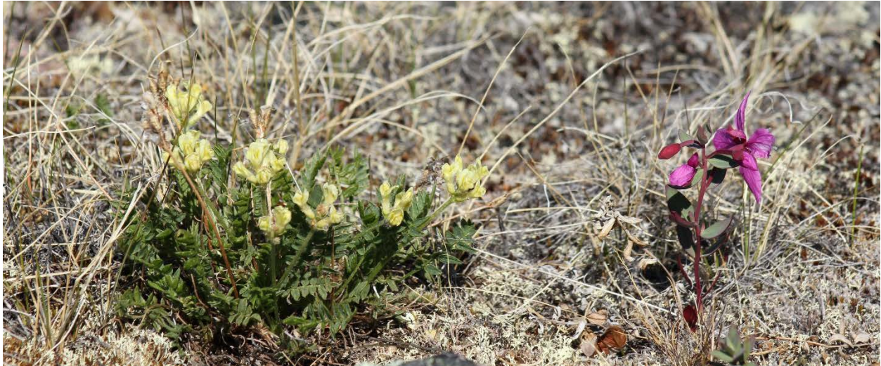
Figure 9: Plant species observed during the BioBlitz.