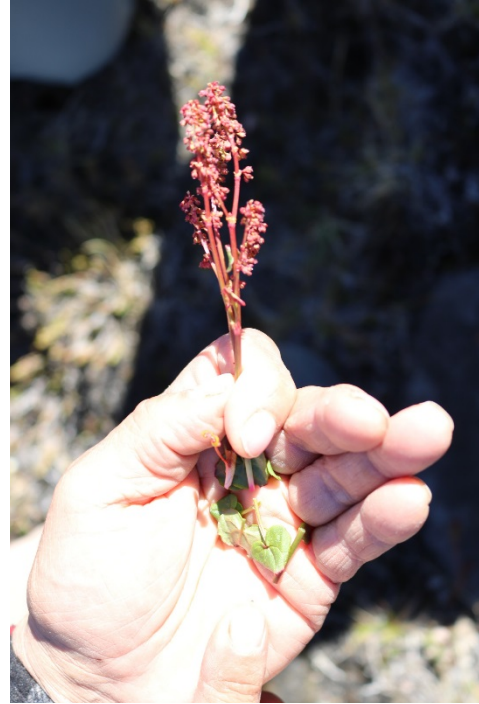
Figure 11: Flower and leaves of mountain sorrel ( Oxyria digyna ).

Caribou, geese, and Arctic hare will eat mountain sorrel. If you eat the Arctic hare intestines, they taste like sorrel.