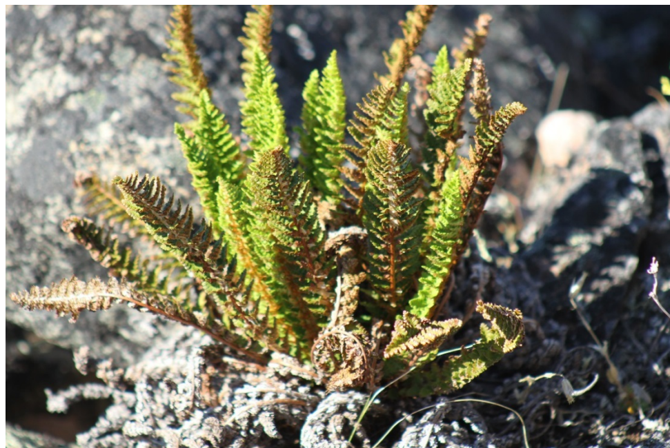
Figure 10: Fragrant fern ( Dryopteris fragrans ).

The Inuktitut name uipuuq refers to the spiral fiddlehead shape of the fern when it starts to grow. The ferns smell good, like perfume. There are more ferns in Nanuqsiutitalik than in other areas, because it is warmer and more sheltered.