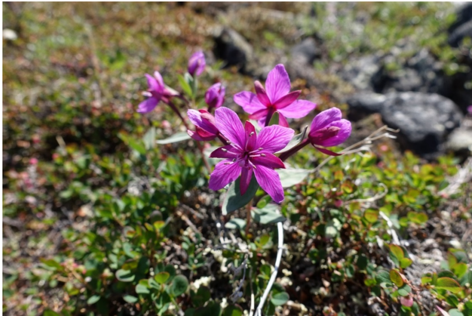
Figure 9: Dwarf fireweed ( Chamerion latifolium ).

Dwarf fireweed grows close to rivers and other water sources. If eaten when fresh, it will make your mouth dry out. It is better to dry it and use it to make tea.