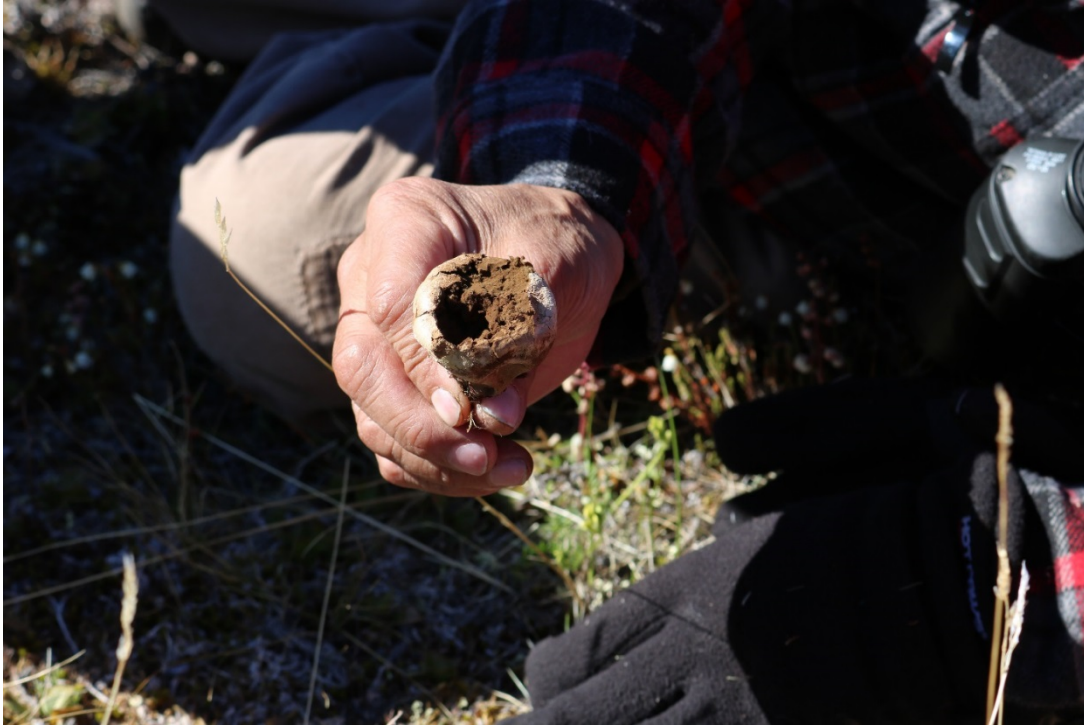
Figure 21: Elijah Panipakoocho discussing the uses of puffball mushrooms.

When puffball mushrooms are first growing, they look like regular white mushrooms, but Inuit do not typically eat them. When they dry, they are called pujuq , and they become fragile. They must be collected before they burst. Inuit would collect puffballs without breaking them and keep them in a bag for emergencies. The powder inside is sterile when you open it. If you have an abrasion or a small cut, you can put the powder on it, as an antiseptic. Then you put a caribou membrane (the tissue between the skin and meat) on top of the wound while it is still moist. This acts like a bandaid. The powder keeps the wound dry and heals the wound so there is no scab.