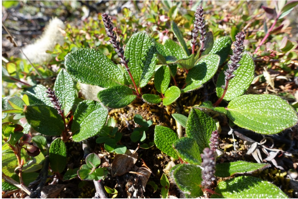
Figure 15: Net-veined willow ( Salix reticulata ).

The leaves of net-veined willow can be eaten. They have a sharp taste, but cooking them in a frying pan makes them more palatable.