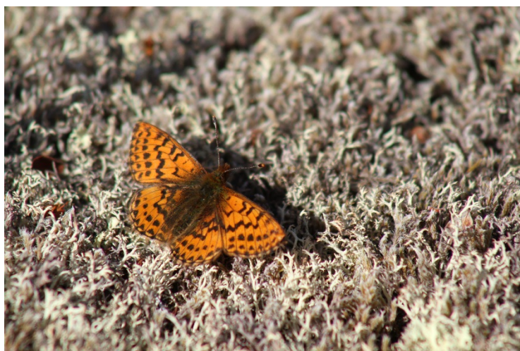
Figure 13: Arctic fritillary butterfly ( Boloria chariclea ) on caribou lichen.