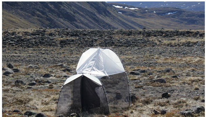
Figure 7: Malaise trap, set up near the BioBlitz Base Camp.

Two types of insect traps were installed during the BioBlitz event. One was a malaise trap, which looks like a modified tent. When insects fly into the side of the tent, their instinct is to climb upwards. When they reach the top, they fall into a container of preserving liquid and are then collected. The malaise trap was installed from 5-8 July 2017.