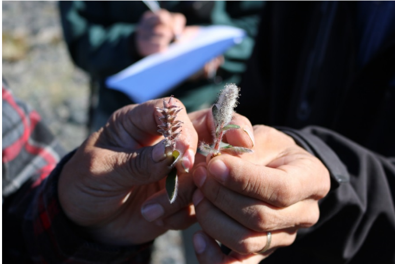
Figure 12: Two willow catkins. The one on the right is sweeter and preferred (as food).

The name suputiit refers to the willow catkins when they have hair or fuzz growing on them. Willows are called uqaujaq before they develop the fur, which means “like a tongue”.