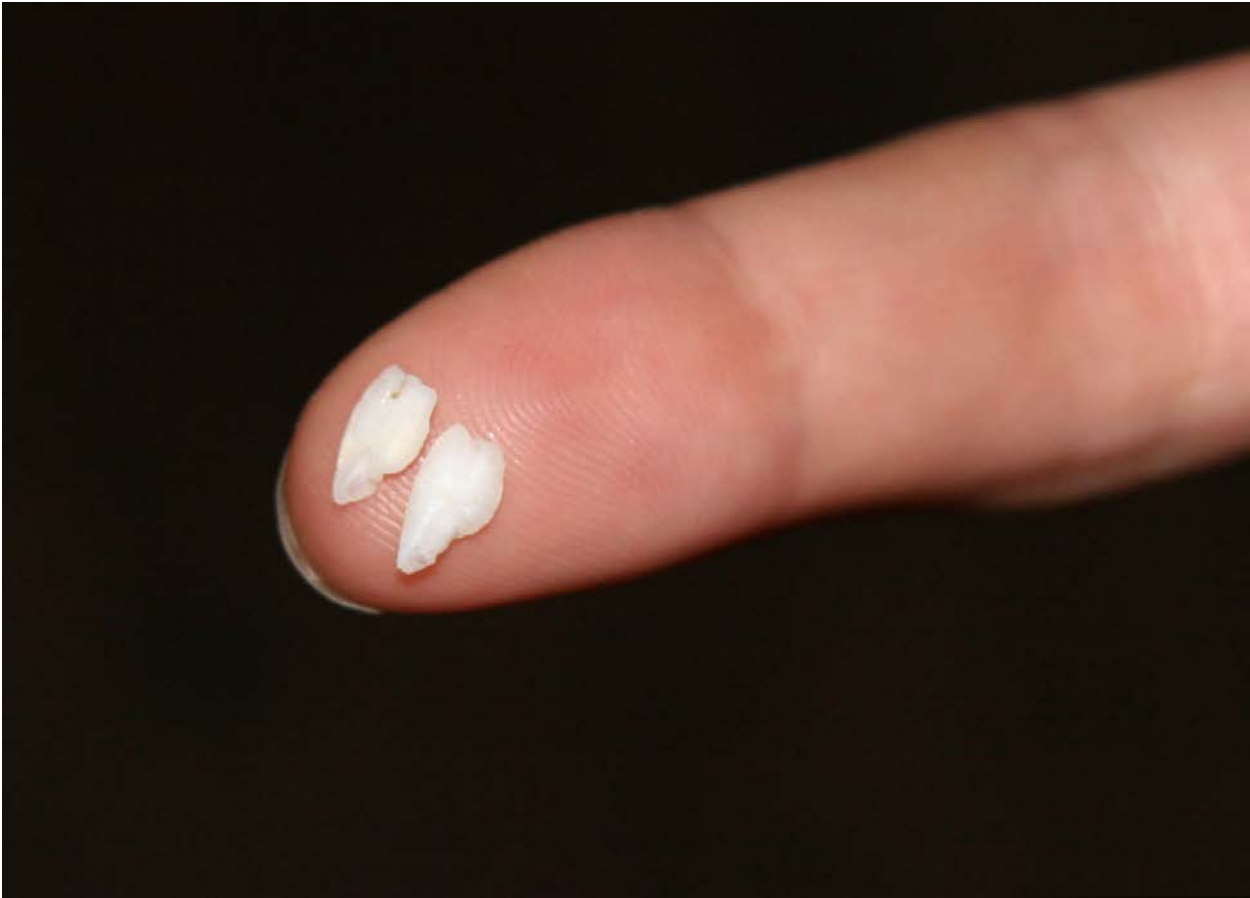
Fig. 1. Paired sagittal otoliths from an adult lake trout.