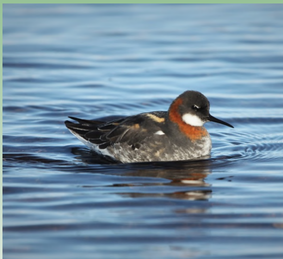
Female Red-necked Phalarope

Issue: Request for decision to approve the Management Plan for the Red-necked Phalarope ( Phalaropus lobatus ), in Canada under the federal Species at Risk Act (SARA).