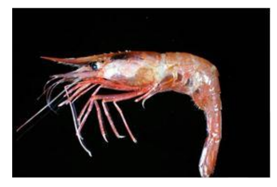
Striped shrimp (Pandalus montagui)