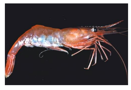
Northern shrimp (Pandalus borealis)