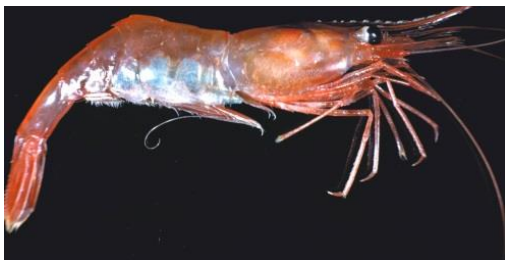
Northern shrimp ( Pandalus borealis )