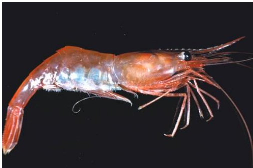
Northern shrimp ( Pandalus borealis )