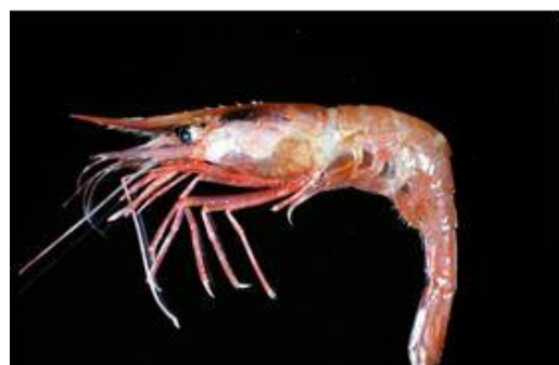
Striped shrimp ( Pandalus montagui )